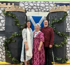
me with my director and his wife

October 28 – November 1: I had the opportunity to attend a missions conference with my mission board director and his wife. It was encouraging to hear the testimonies from the other missionaries, and we were able to have several good conversations with students. While I was staying in the girls' dorm, I had the opportunity to share my testimony with the ladies at evening devotions. Pray that these students would be challenged to give their lives to missions!